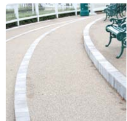
• Product: Naturewalk • Market Sector: Stadia • Location: UK • Client: Royal Ascot • Date: 2006

The going was good at Royal Ascot with the installation of Naturewalk, the dynamic new flooring system from Flowcrete. Using the latest in flooring technology, Flowcrete has developed a resin bound gravel system to create Naturewalk, which transforms outdoor areas into eye-catching, attractive environments.